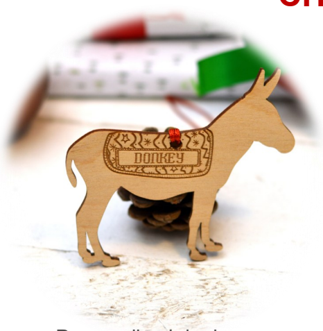
Personalised donkey decoration £5.95 www.thecraftygiraffe.co.uk