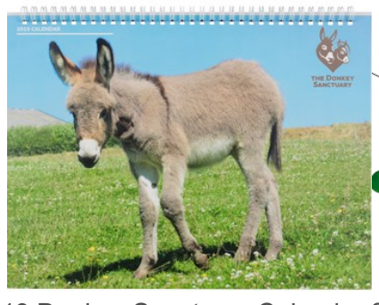
2019 Donkey Sanctuary Calendar £9.50

Fairisle donkey scarf 14.50 www.thedonkeysanctuary.org.uk/shop