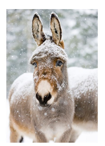
Christmas Cards £4.75 for 10 www.shoprspca.org.uk