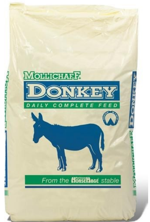
Mollichaff Donkey - especially designed for donkeys - from your local feed merchant