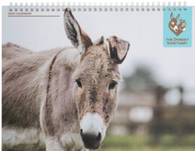
2020 Donkey Sanctuary Calendar thedonkeysanctuary.org.uk/shop