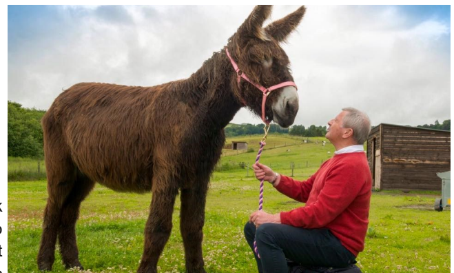
Hettie at Perth Show

Champion Donkey at the Highland, the Border Union and Perth show this year was Elma with Mist. Gamlingay Love-in-a-Mist to give her formal title swept all before her rendering the points championship a walk over.