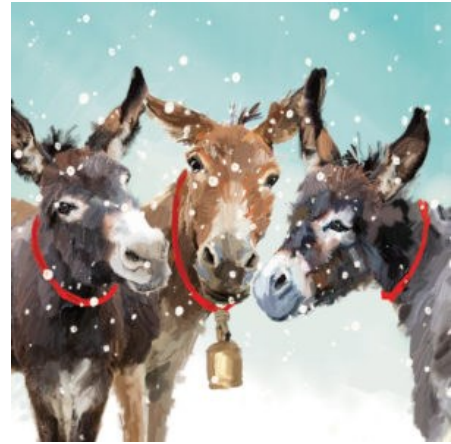
Christmas cards spana.org