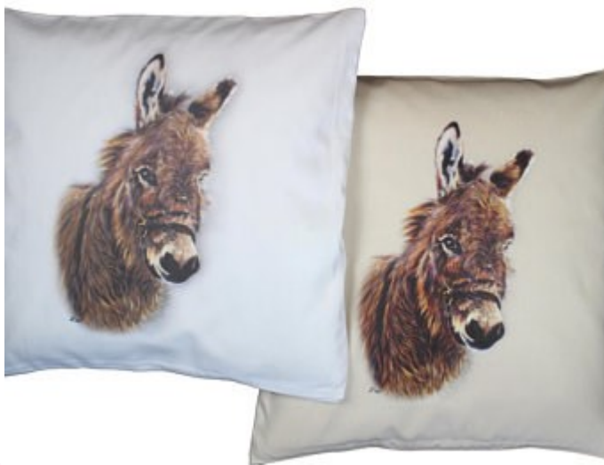
Donkey cushions etsy.com