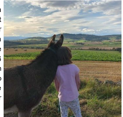
A Deeside view