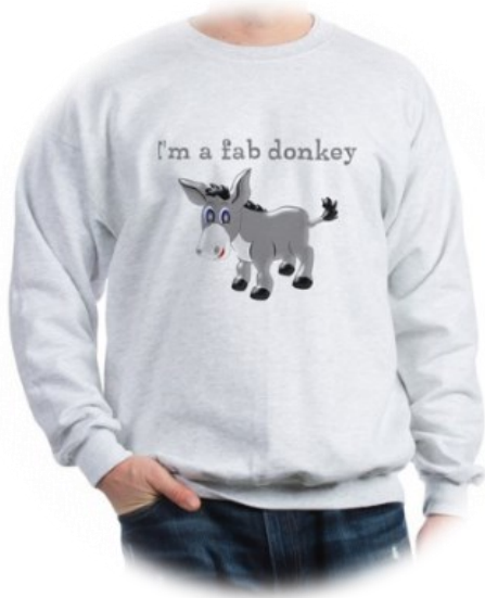
Personalised donkey sweatshirts CafePress.co.uk