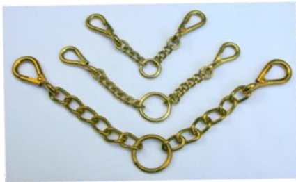
Figure 1 Newmarket Coupling