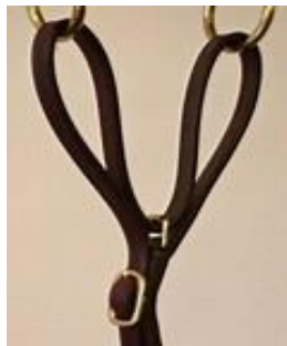
Figure 2 Butterfly attachment

Don't forget that there is a super section on the DBS website all about showing, covering rules, classes, points and with the Affiliation Form and Points Card too. You can find all this and more at: https://www.donkeybreedsociety.co.uk/about-donkeys/activities/showing/