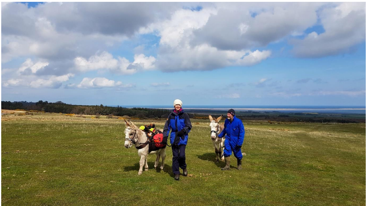
and across vast, beautiful spaces.

Lockdown logic: if these pictures have got you desperate to be out, don't despair, make a list of the places you would like to visit as soon as you are able (decorate with pictures and uplifting words/phrases). Stick your list somewhere prominent and make sure you relish in adorning it with great big ticks just as soon as you can!!