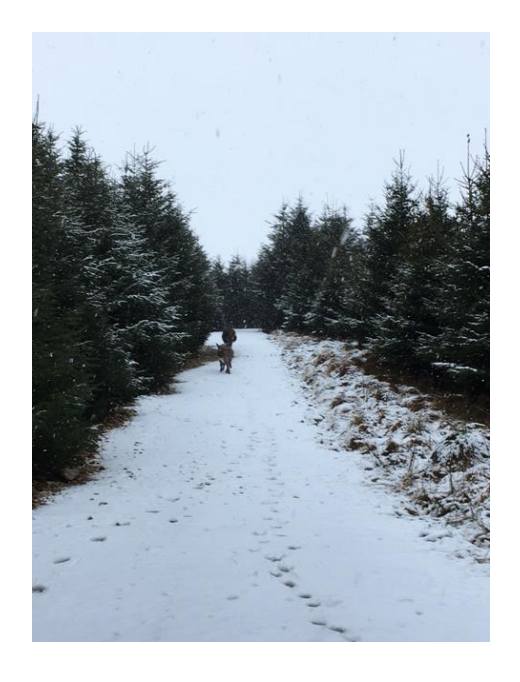
Whatever the state of the path, togetherness is a nice trek! Below, in the summer and right, as the path is now.