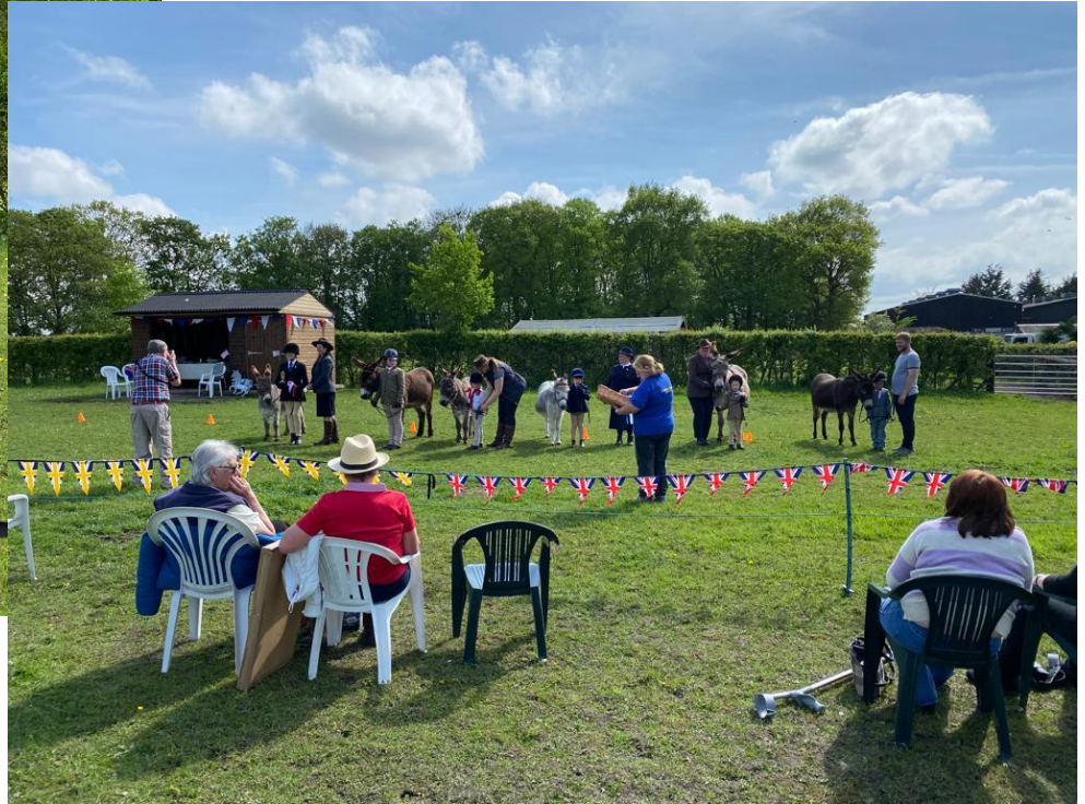
Champion and Reserve Champion (below)